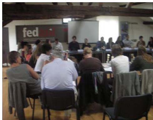
Meeting with international partners at Fedasil

In 2006 the Ministry for Social Integration and Fedasil extended this operational project. We started cooperating closely with local Caritas in Ukraine, Bulgaria, Armenia, Georgia and Serbia Montenegro. Together with Fedasil we also made an evaluation visit to Bulgaria and Armenia in 2006, revealing us the added value of a local structure.