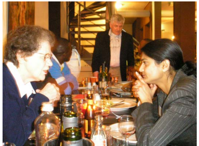
Some discussions continue throughout the evening

The last afternoon was devoted to a meeting with the members of ERSO to prepare the project's operational future. New prospects seem to emerge, in particular with regard to the collaboration of different countries on the same project: the file of an Armenian family submitted by Austria for example would be financed by CORDAID and managed by Caritas Belgium and its structural local partner.