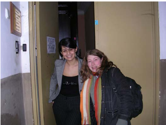
Our contact persons at GYLA and World Vision, Georgia

Our local partners in Armenia, Georgia and Serbia answer to specific questions of any returnee candidate, whatever their nature is. These questions may concern the possibilities and prospects for reintegration (education, employment, housing, family/ tracing) but also the potential risk factors (safety, political situation, etc).