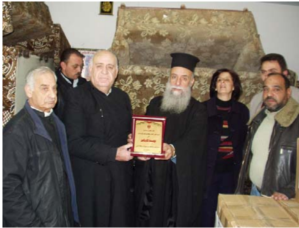
Religious leaders representing Caritas Jerusalem accepting a thank you plaque from the Governor of Nablus

Two people were killed and some 25 persons were injured seriously with many of those still in hospital. Over 100 persons received minor injuries for which they were treated and released from medical care. Many scores of people were arrested and two schools in the region were commandeered to act as temporary jails while the large number of people were arrested awaiting processing.