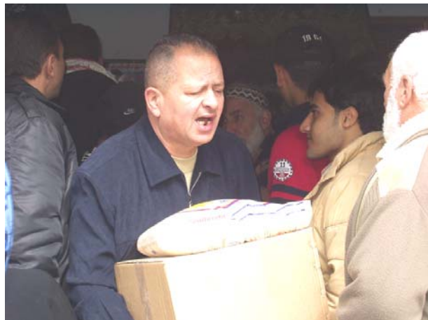
A recipient of the humanitarian aid package in Nablus

Sadly, the situation in Nablus is at its worst now, but this is just one area in the West Bank which is increasingly divided into segregated areas with extreme difficulties in moving between the areas. The social, economic, psychological impacts of this whole situation are leading many into increased desperation, hopeless, lack of trust in public officials and feelings of isolation.