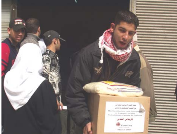
Caritas Jerusalem provided the food aid to very needy families in Nablus.

movement restrictions in that area are very closely monitored by the Israeli army. The map on the previous page illustrates this very well. Note that the black arrows around Nablus show that permits are required for people to leave Nablus. Every segment of the population are affected by this tight closure policy including sick people, breadwinners seeking employment and students. In addition, the community has taken an economic hit and is facing almost depression like conditions.