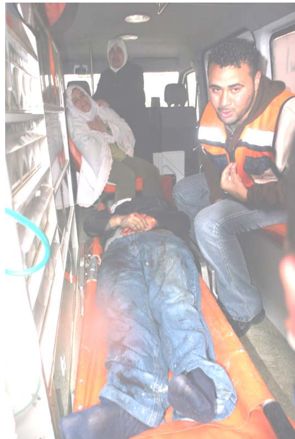
A victim (photo right) of the recent military incursion in Nablus and his devastated relatives.

Young men are facing particularly difficult times in the current situation. According to UN OCHA: “Between 7 and 20 February, for example, age and residence restrictions were re-imposed at checkpoints throughout Nablus, Tulkarm and Jenin governorates. Palestinian men between the ages of 16 and 35 years were not able to cross major checkpoints to travel south.” 1