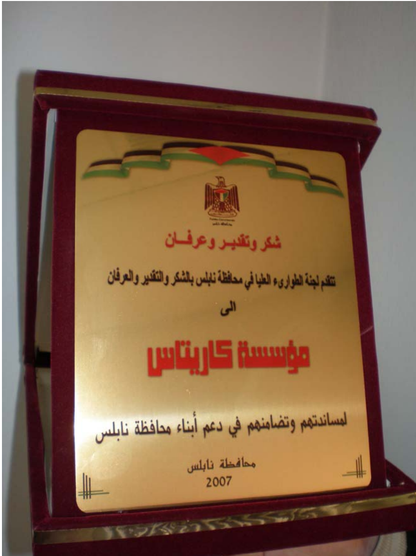
An official acknowledgement of thanks from the Mayor's office in Nablus to Caritas Jerusalem for our role in providing humanitarian aid to the people in Nablus