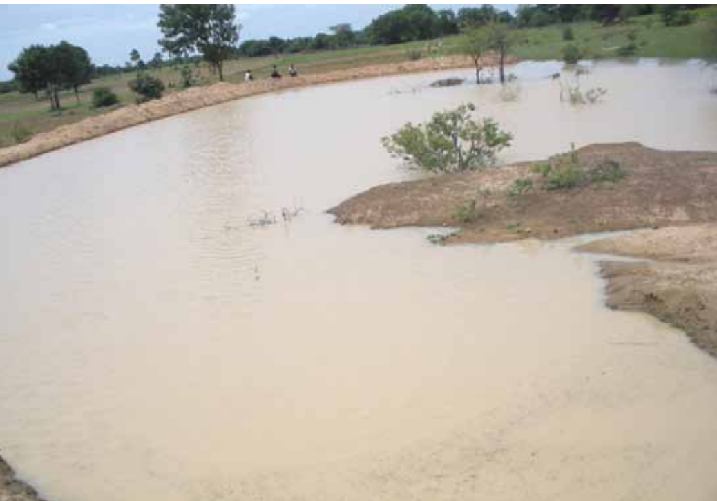
Image: Rain Water Storage Pond

R ural areas in Warangal district are mainly dependent on groundwater as a source of drinking water. Nearly 70 per cent of the population depends on open wells and bore wells. Tap water (piped water) is used by 24 per cent of households to meet domestic and drinking water needs. Nearly 90 per cent of rural households collect water from community sources. Almost 70 per cent of rural households report having secure access to drinking water. As a result of severe drought and the depletion of groundwater, existing water sources have dried up and gaining access to drinking water has become a challenge for many villages, especially in summer.