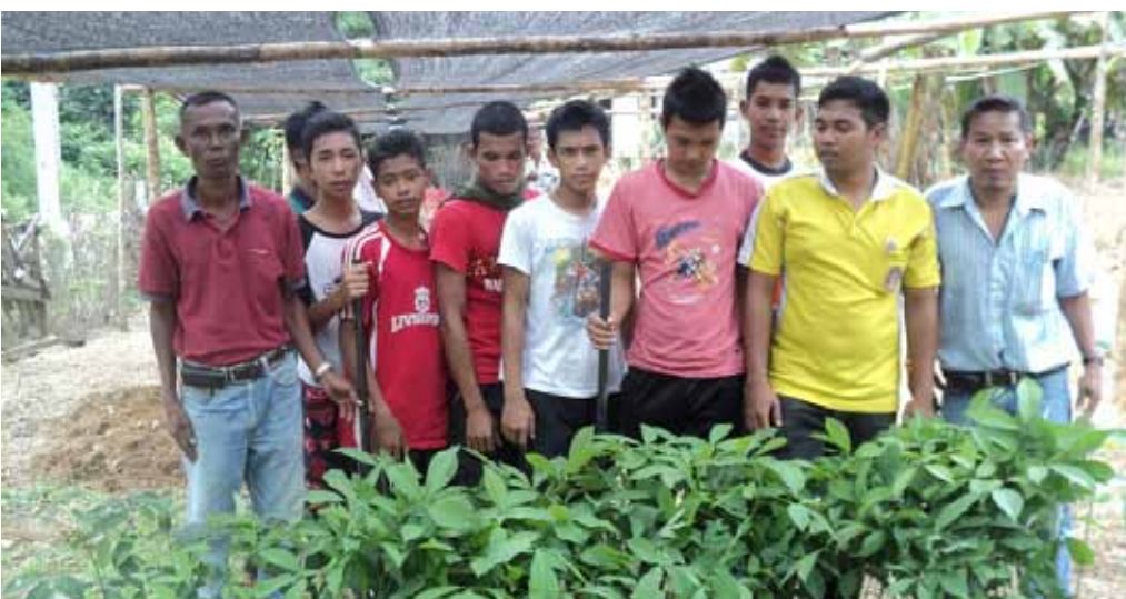
Image: Training Youth (Rubber Seedlings Moo 8 Dusongyour Narathiwat)