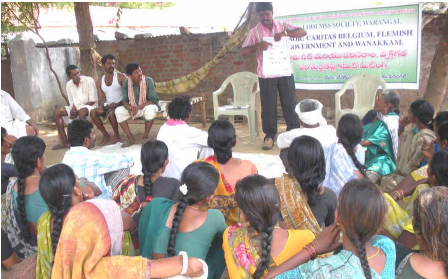
Image: A Village Water and Sanitation Committee Training on Water Harvesting

The desiltation programme will also improve the storage of water in irrigation tanks and additional land will be irrigated with the increased supply of water. With the application of silt in the agricultural fields, it is anticipated that soil nutrients will be increased and farmers will be able to reduce expenditure on chemical fertilizers and at the same time expect better income and yields from their land. The removal of silt from irrigation tanks is also expected to recharge the surrounding bore wells and open wells, allowing more land to be cultivated.