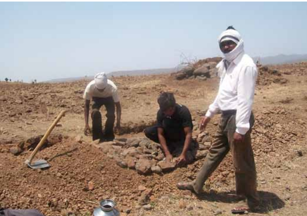
Image: Water Retention Structures

Equally (or even more) important is the change in the mindset of communities, who are now more inclined towards self-improvement and self-dependency.