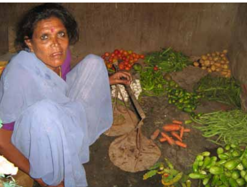
Images: Food Security in India