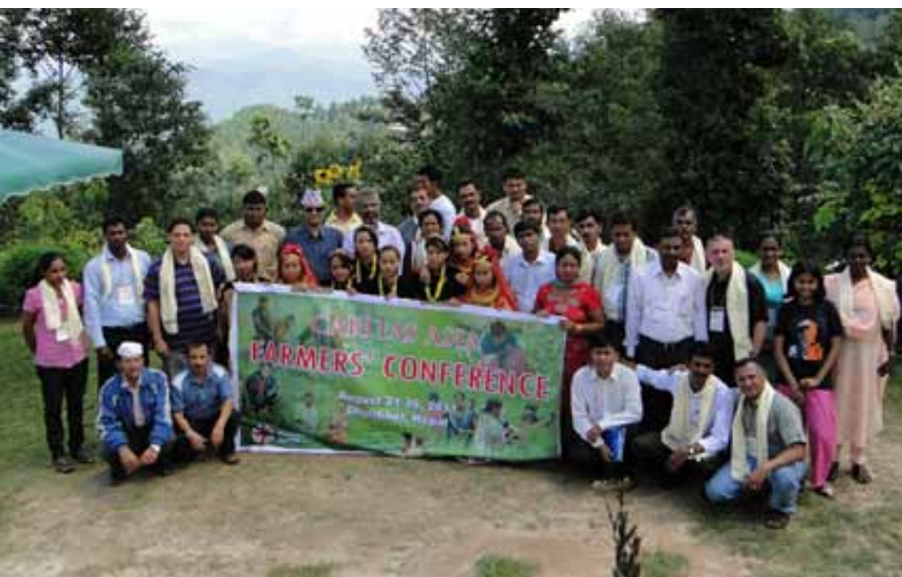
Image: The Participants of the Farmer's Conference, Nepal